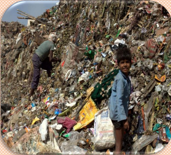
Bhalswa landfill site, rubbish is not processed or segregated but dumped on top of older waste