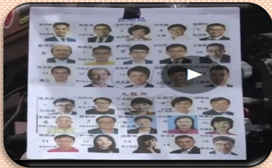
Hong Kong Legco elections: Radical democrats gain foothold, likely to rile China

Young activists support Hong Kong's independence from China. It comes as fears grow that Beijing is tightening its grip on the semi-autonomous city in a range of areas, from politics to education and media