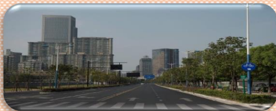
An empty street in Hangzhou on 2 September 2016. Factories have been closed to ensure blue skies during the G20.

Subjects: History, Geography, Citizenship