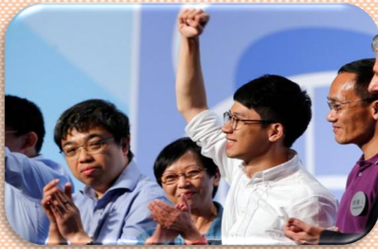
Nathan Law (centre) celebrates after winning a seat on the legislative council.

Subjects: History, Civics and Citizenship